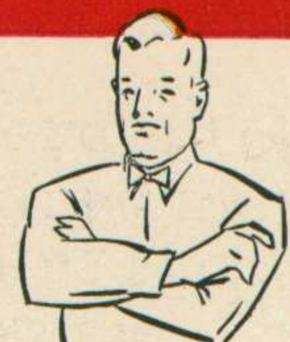
Delay of game or extra time-outs