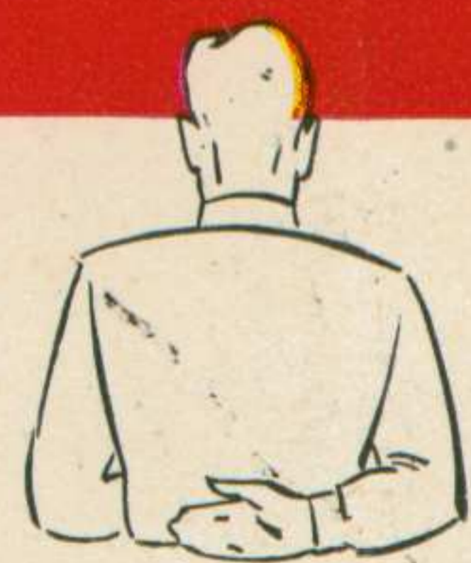
Illegal forward pass