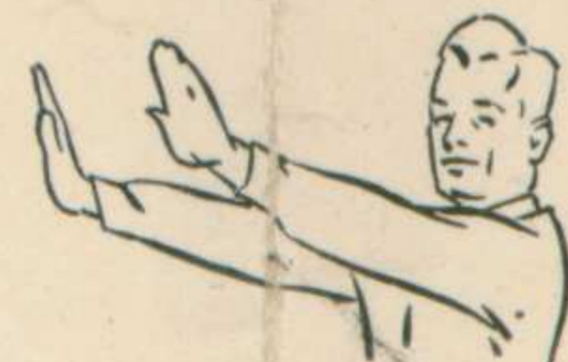
Interference with forward pass