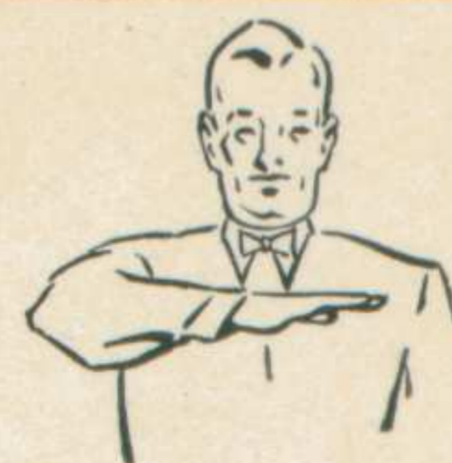
Player illegally in motion