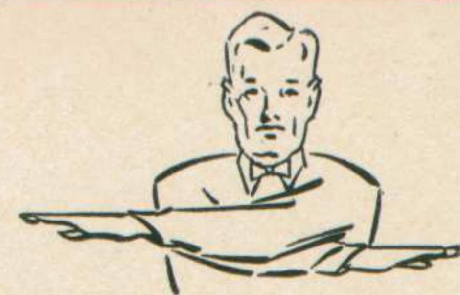
Penalty refused, incomplete pass, missed goal, etc.