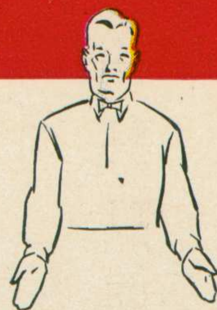
Crawling, pushing or helping runner