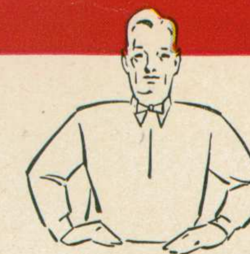
Off-side and violation of kick-off formation