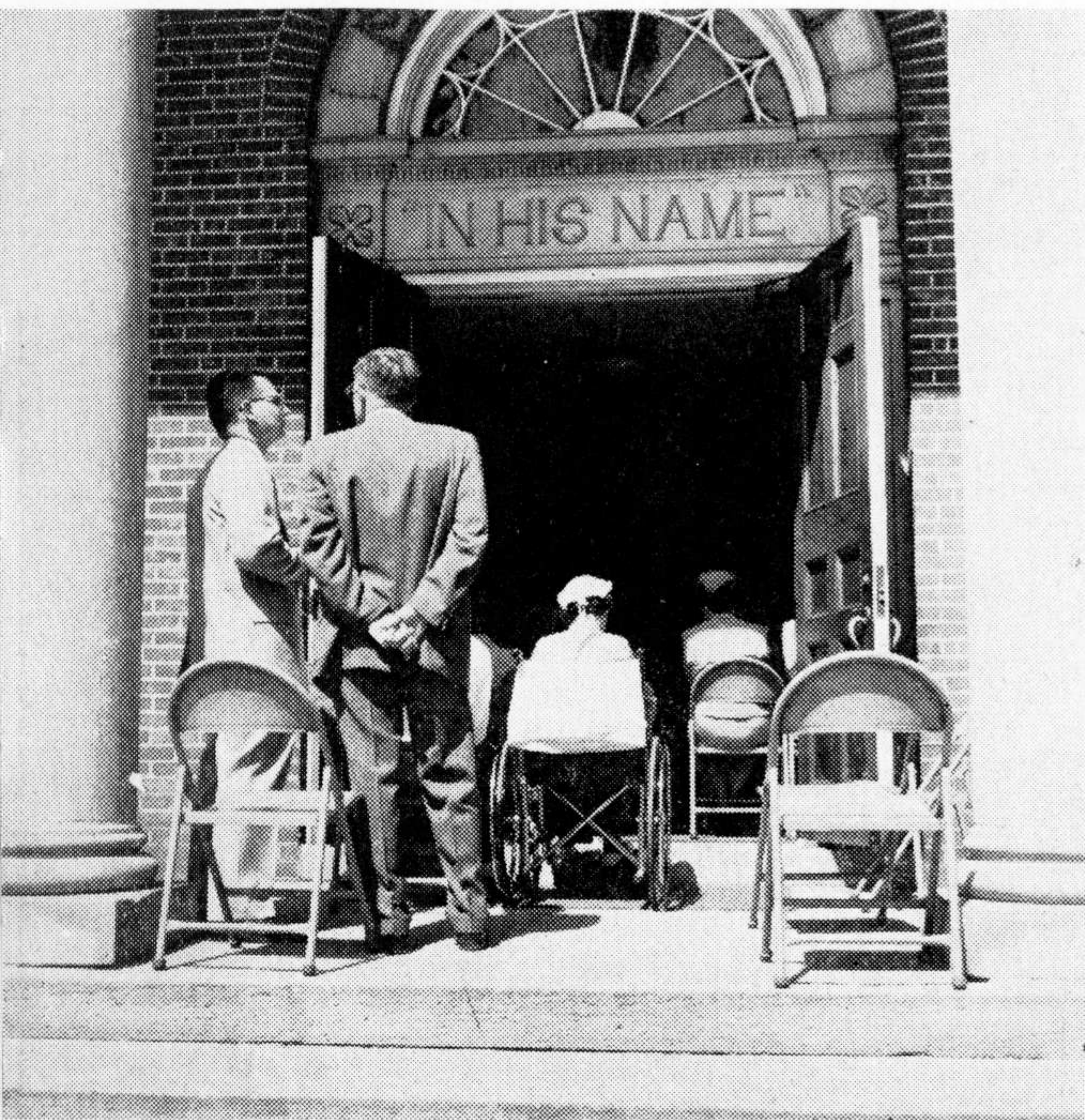
A Sunday Morning in Warm Weather

1957 — 1393 members trying to worship in a Church seating only 220 as planned in 1926.