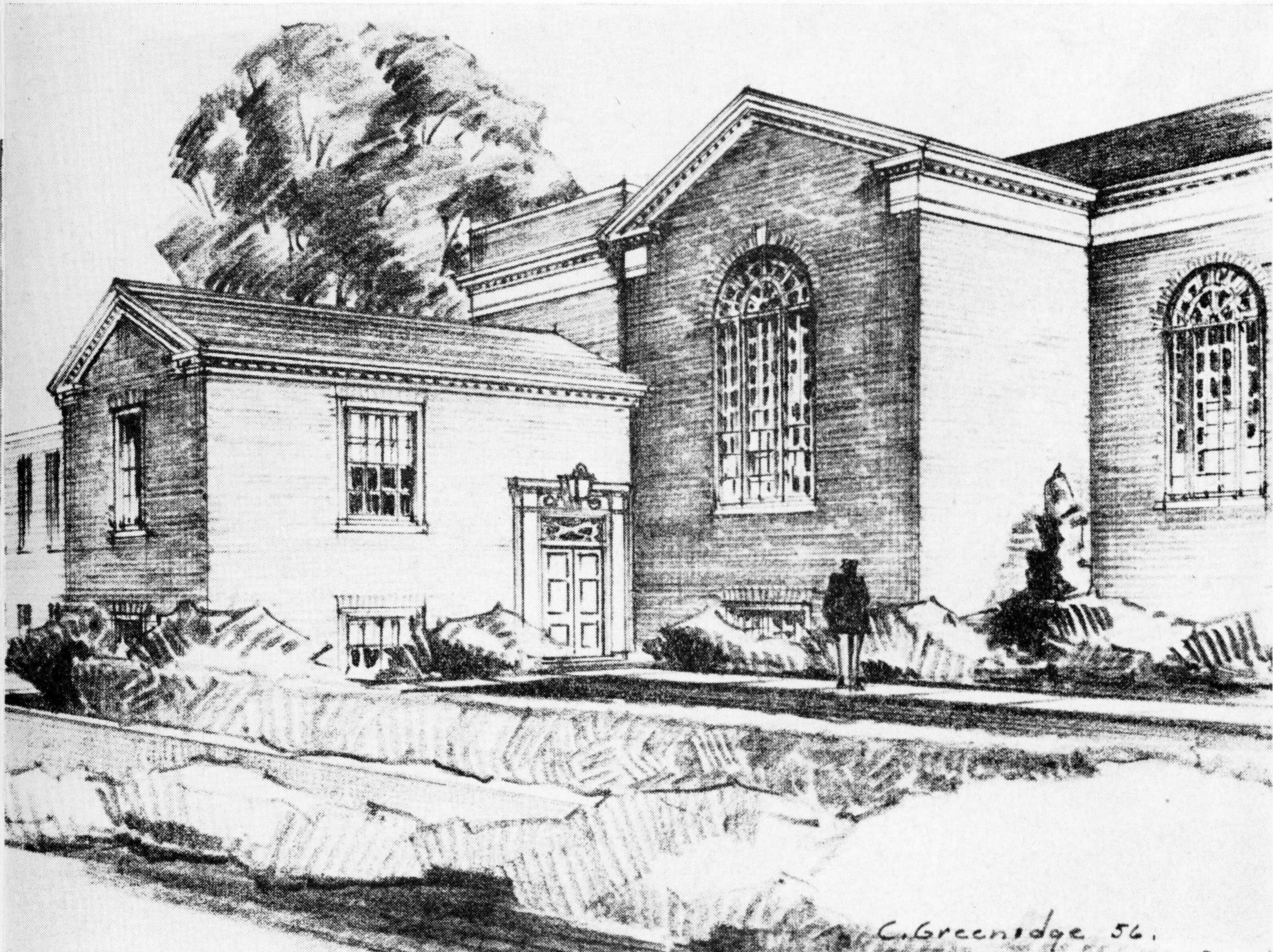
Southwest Corner Elevation of the Proposed Addition