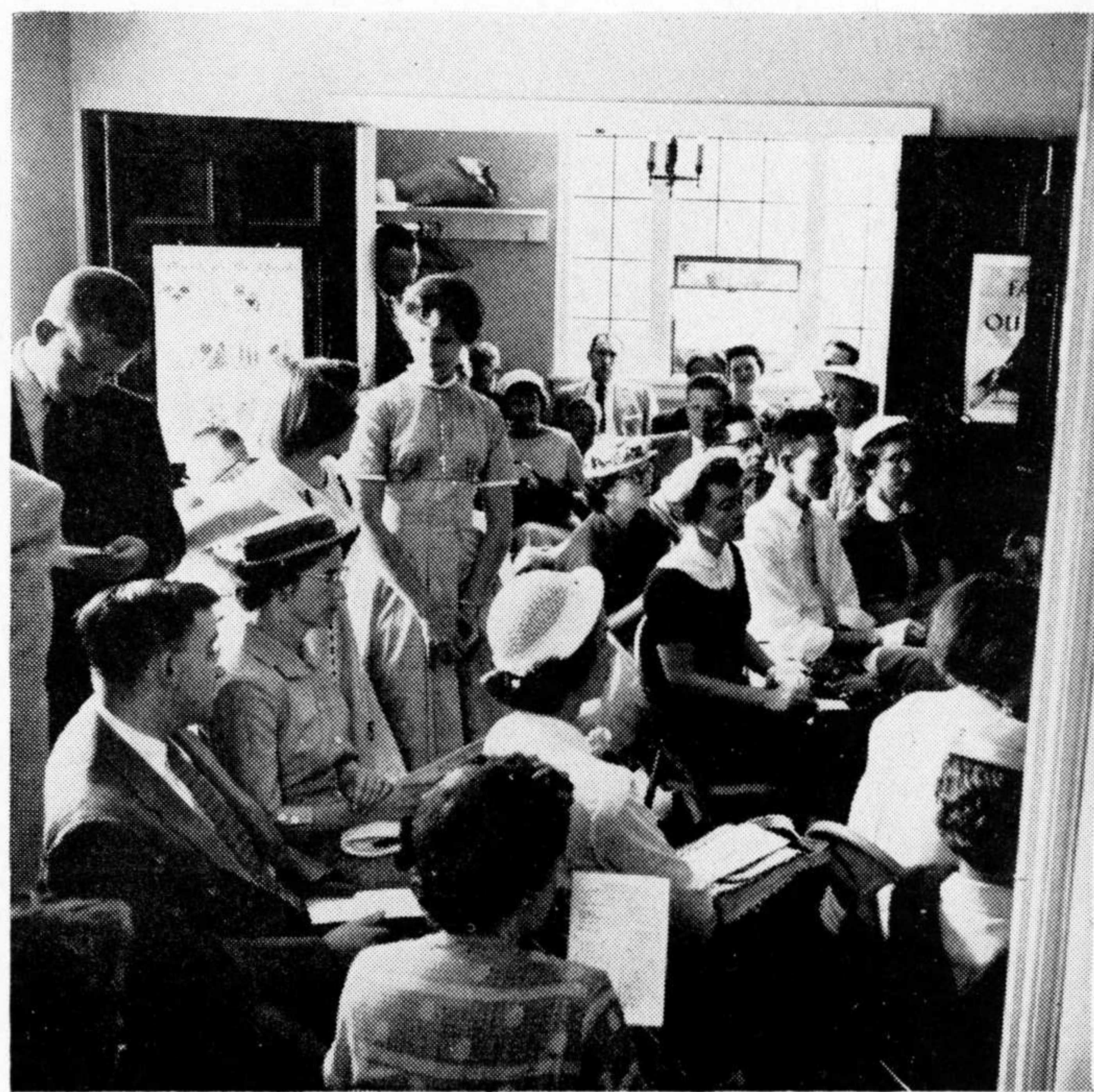
Sunday Morning Anytime