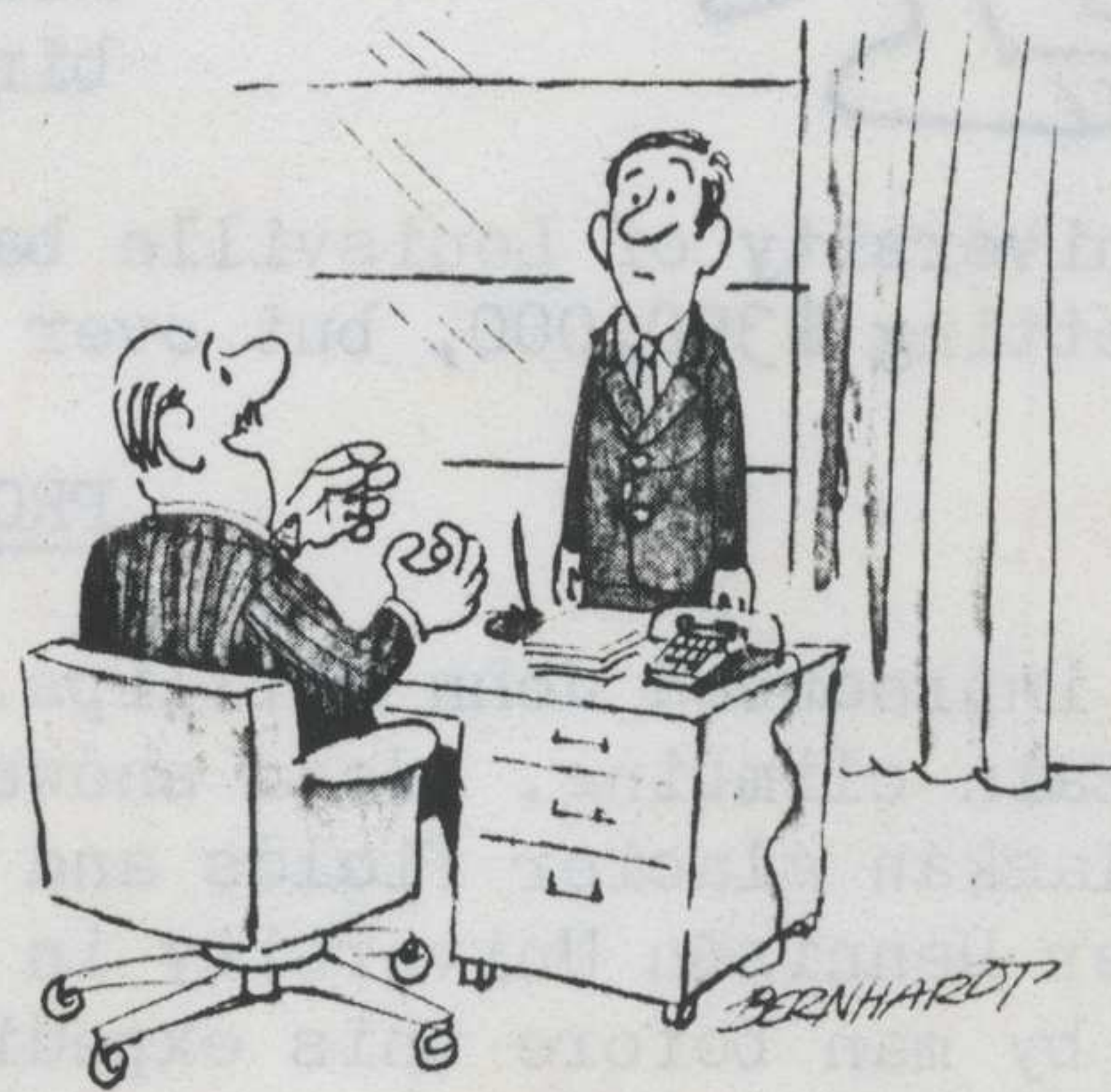
"Look at it this way, Rockwell—somebody has to hold the ladder of success."

The Object of Rotary is to encourage and foster the ideal of service as a basis of worthy enterprise and, in particular, to encourage and foster: