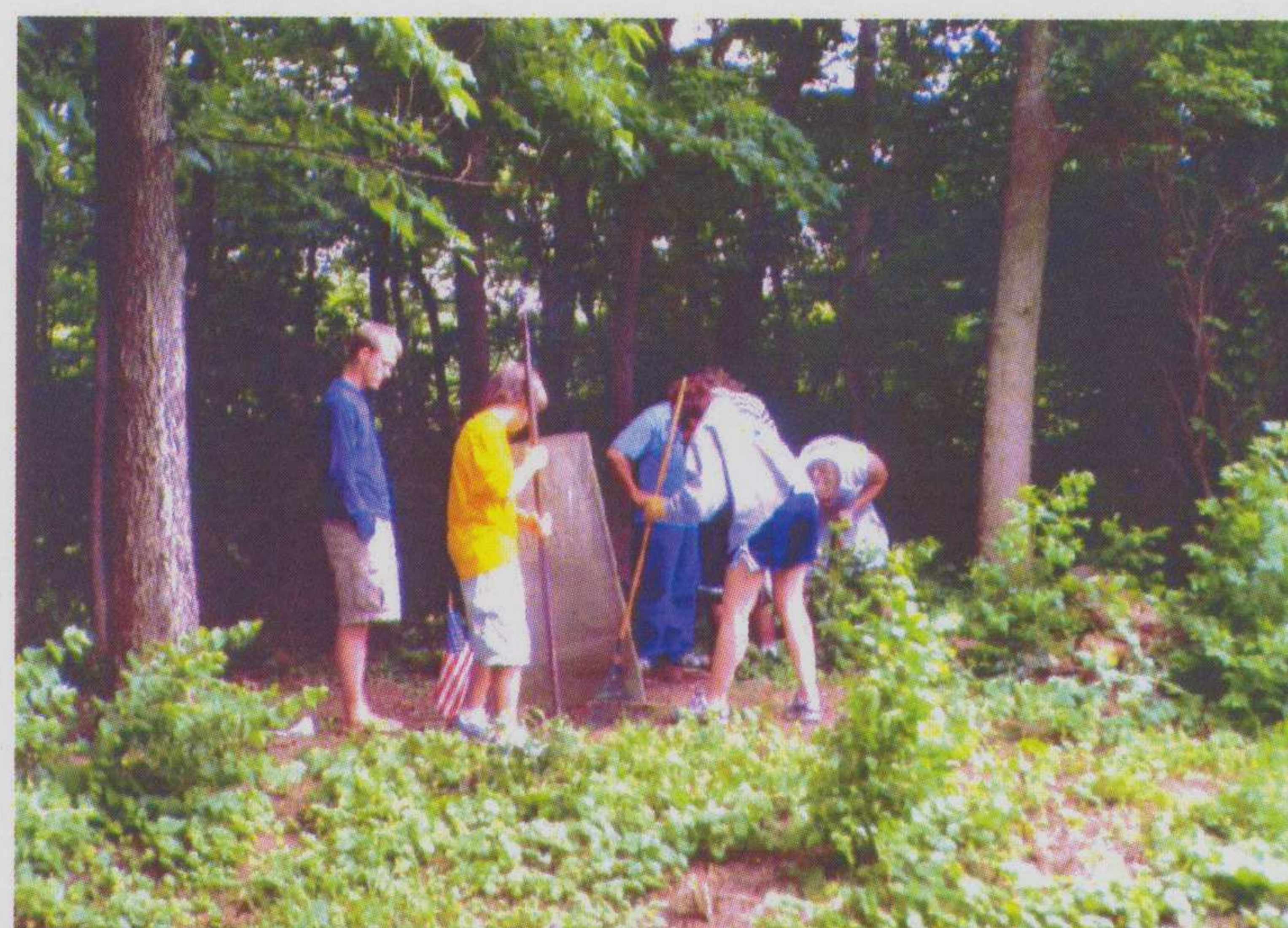
Linworth Youth clear the Goodrich Cemetery site