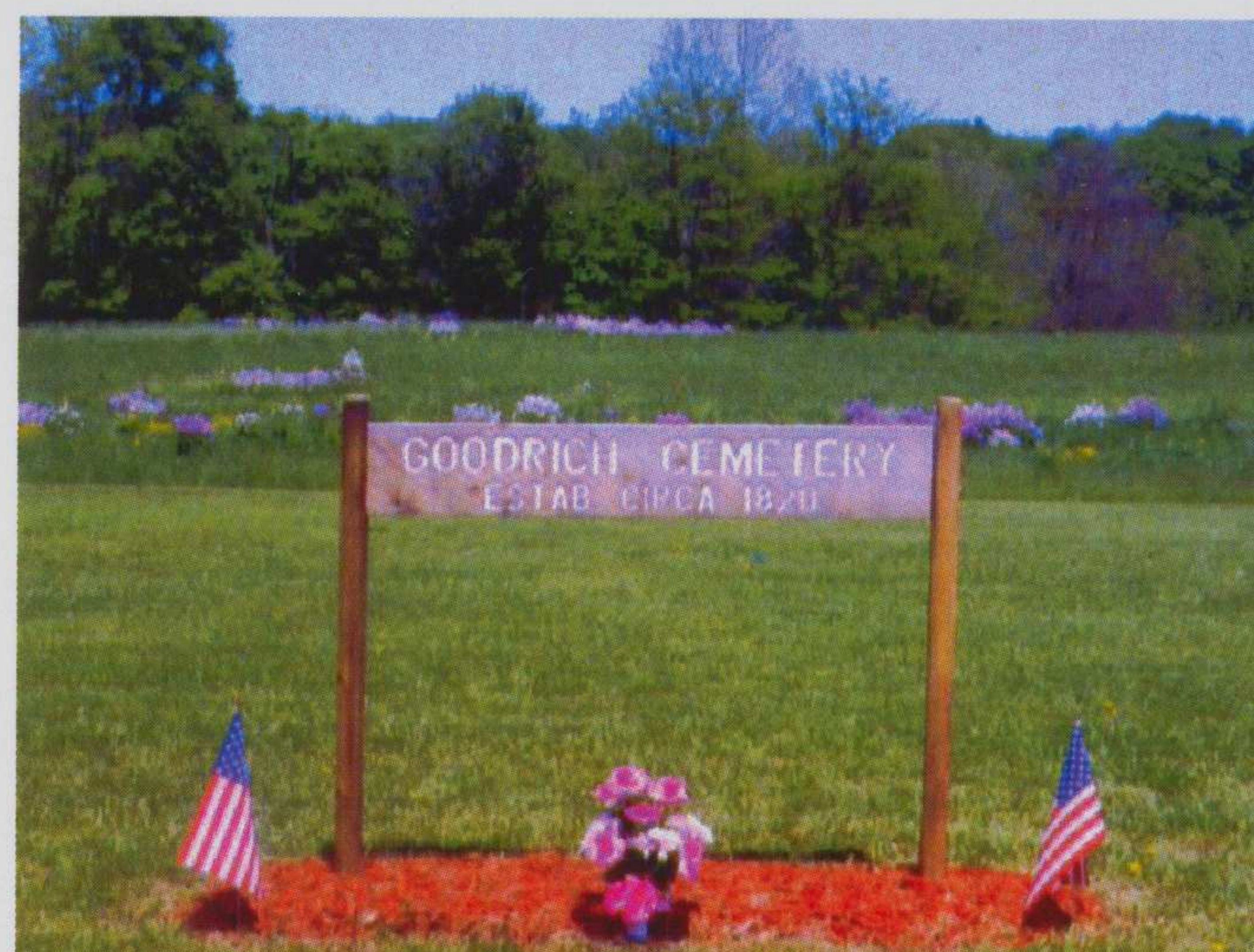
Sign Memorializes the Goodrich Pioneer Cemetery