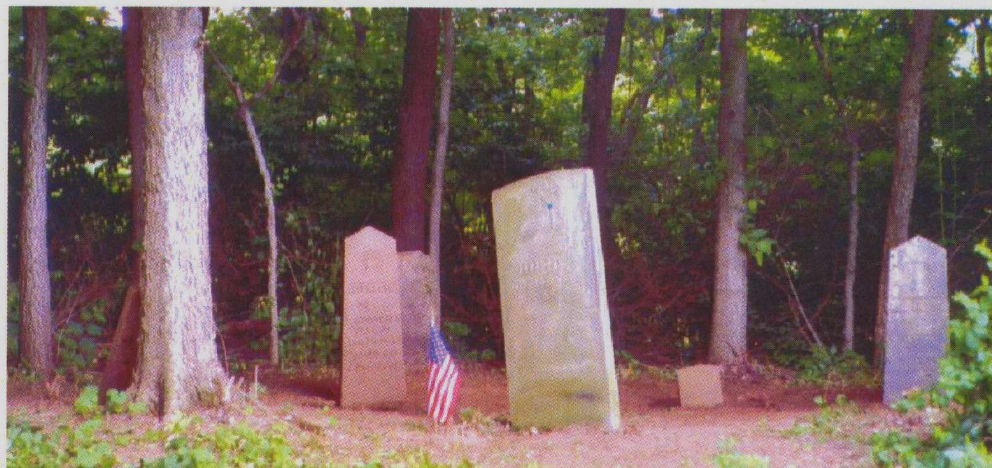
The Goodrich Cemetery cleared