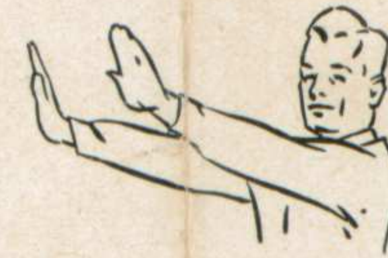
Interference with forward pass