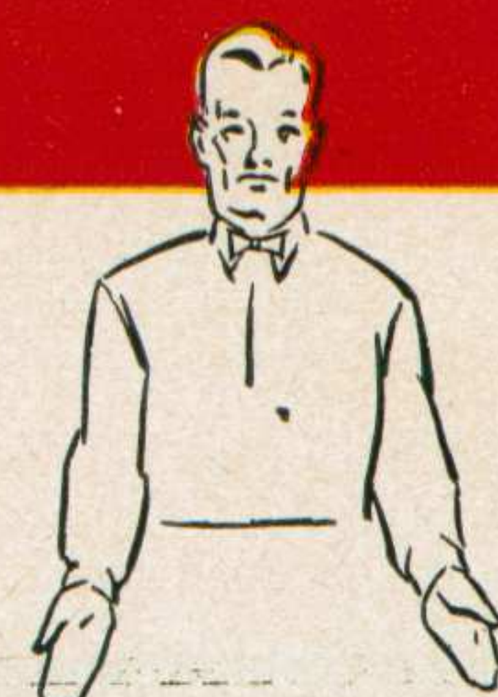
Crawling, pushing or helping runner