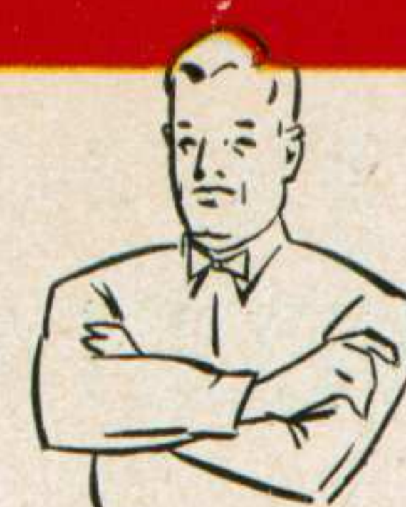
Delay of game or extra time-outs