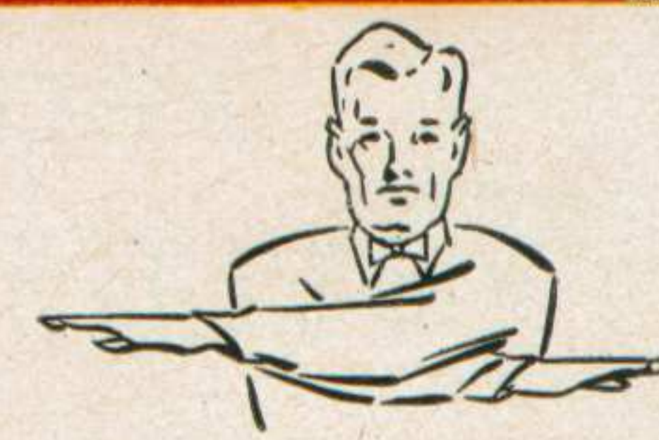
Penalty refused, incomplete pass, missed goal, etc.