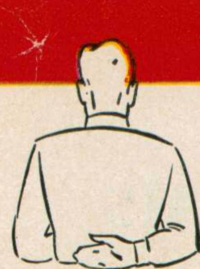
Illegal forward pass

PATRONIZE THE REFRESHMENT STAND A JUNIOR CLASS SERVICE AT ALL GAMES!