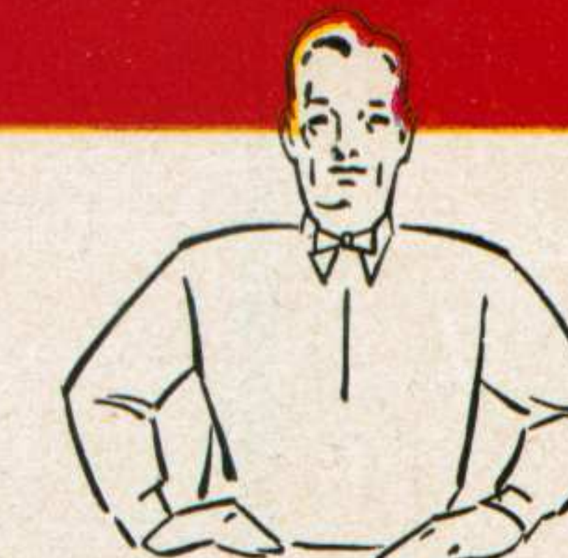
Off-side and violation of kick-off formation