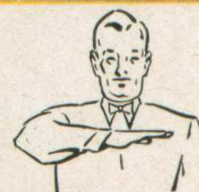
Player illegally in motion