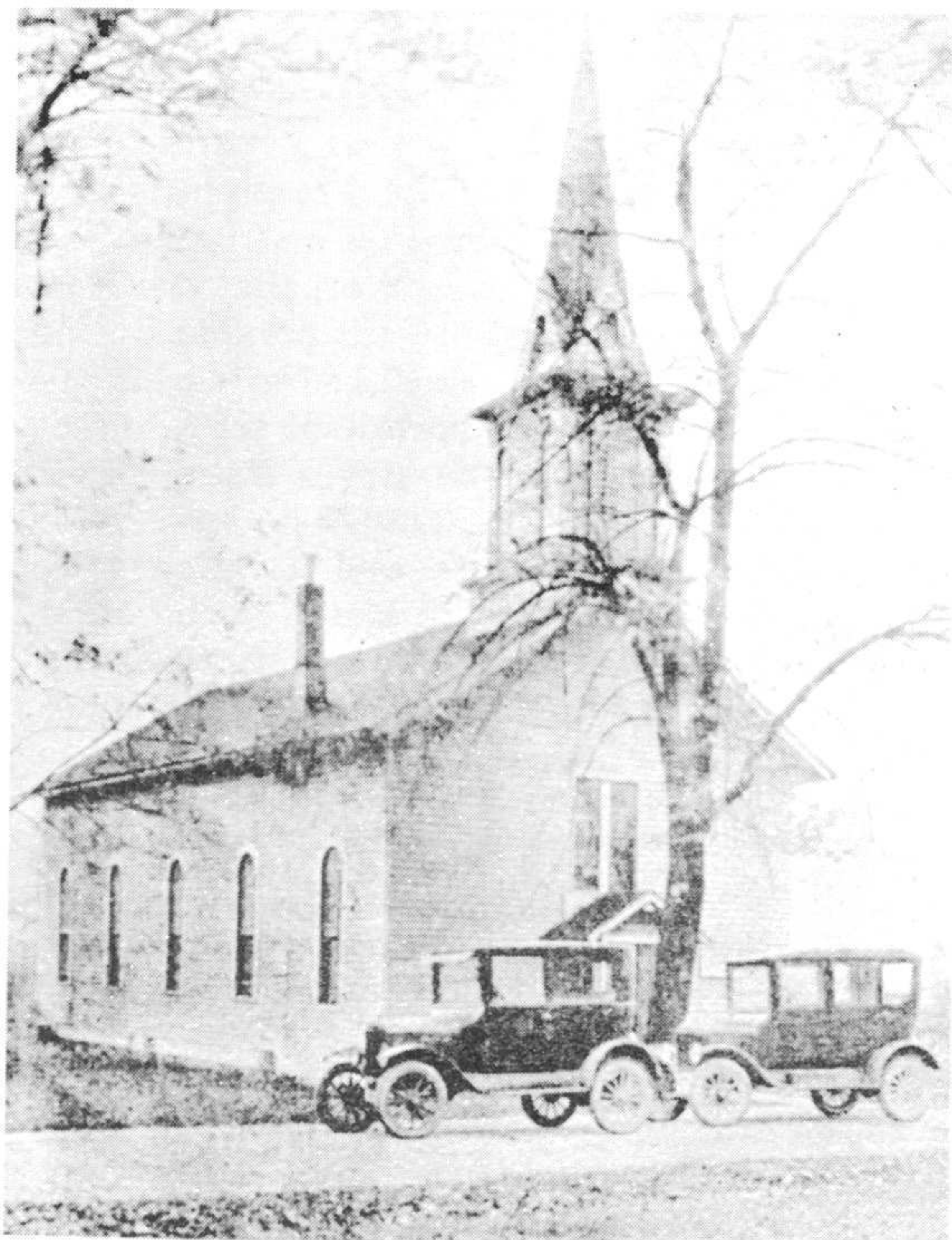
The Worthington Presbyterian Church in the early 1920's

building had served our community for many years and for many purposes. Because of the construction requirements involved in the enlargement of our new sanctuary it became necessary to replace it completely. The building served a Christian Community for one hundred and twenty-five years.